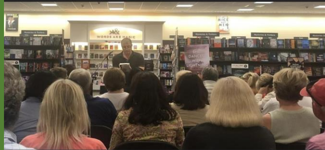
Great event tonight thank you Barnes & Noble! #shedancedwithlightning #newbook #epilepsyawareness #epilepsy #barnesandnoble